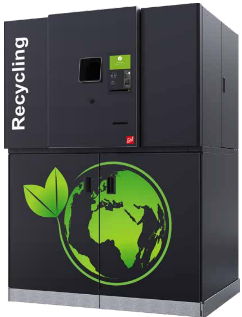
Example: SiCompact 2020 with standard design

A variety of front brandings – to suit each individual customer – can be applied.