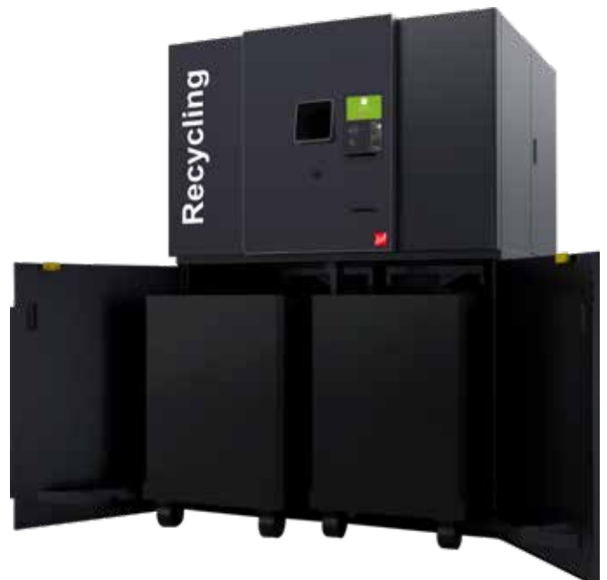
SiCompact with two half pallets