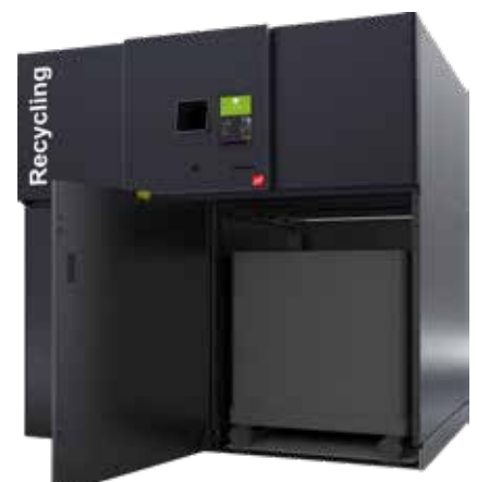
SiCompact XL with two Euro pallets