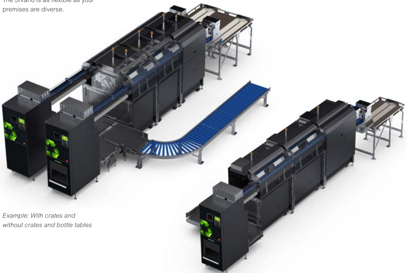
Example: With crates and without crates and bottle tables

The SiVario is as flexible as your premises are diverse.