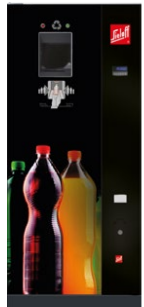
SiOne Small RB (Design C "colour explosion", bottles, multi-colour, operator panel painted in door colour)