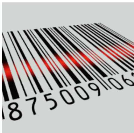
Empties recognition by their barcode

Thanks to our well-thought-out concept, low maintenance operation is guaranteed for all locations.