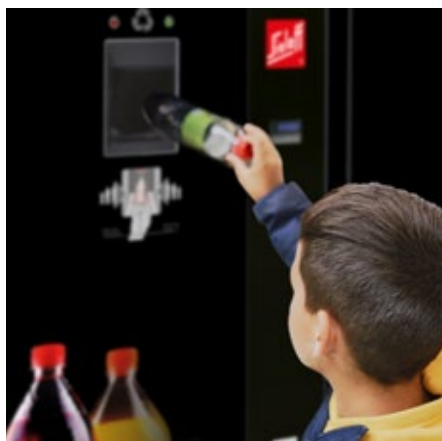
Straight forward and secure return process