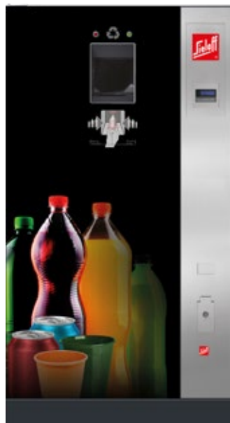
SiOne EB (Design A "colour explosion", bottles/cans/cups, multi-colour)