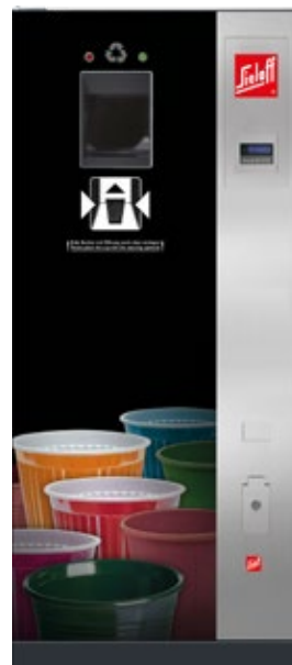
SiOne Small EB (Design B "colour explosion", cups, multi-colour)