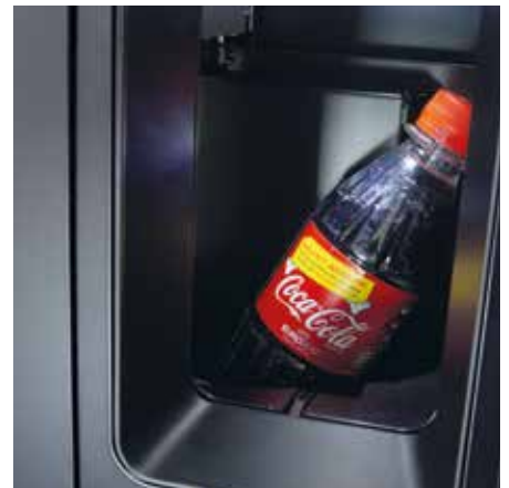
The SiLine GF RP for extremely smooth product delivery