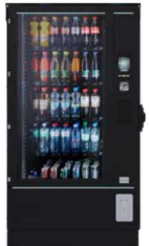
SiLine GF M RP RA Design package A, high security frame