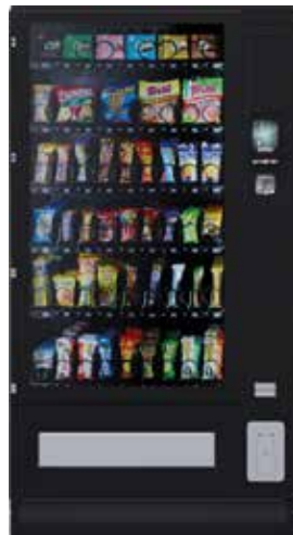
SiLine Snack M RP RA