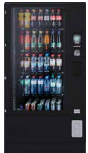
SiLine GF M RP RA