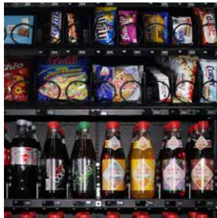
The SiLine Combi RP offers variety and capacity in a compact space