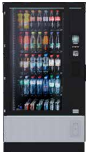
SiLine GF M RP VA Design package A, high security frame