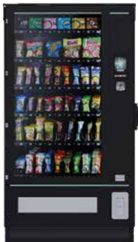
SiLine Snack M RP RA Design package A, high security frame