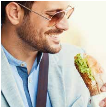
Fresh snacks en route: Delivered effortlessly by the SiLine Snack RP or Combi RP

The operator uses the deal function to offer a combination of two products.