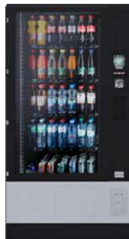
SiLine GF M RP VA