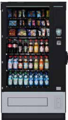
SiLine Combi M RP VA Design package A, high security frame