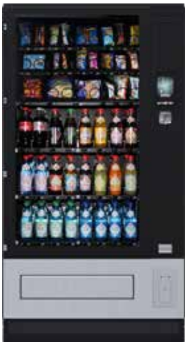
SiLine Combi M RP VA