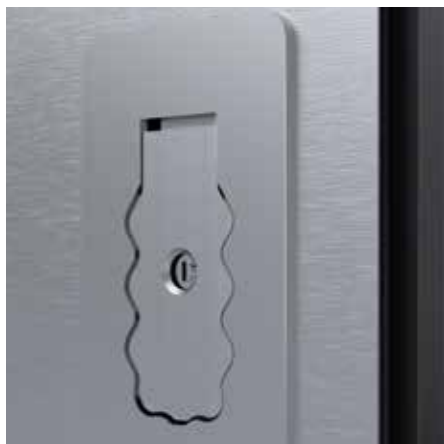
The wavy-shaped locking lever protection safeguards the SiLine® Public series from being levered or prised open

Also available as an optional extra is the high-security frame with side lock and CES mortise lock (KESO as an option) for installations without housings. The frost monitoring function keeps the internal temperature above 0 °C when the outside temperature is down as low as -20 °C. The laminated safety glass panel with light filter protects the products in the machine from potentially harmful sunlight.